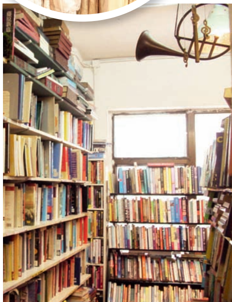
Old School Clockwise from top left: SatisFactory is the place when in need of something to wear for a day at the races; Vintage HK is home to a variety of vintage clothing and jewelry; rows of bulging bookshelves at Flow Organic Bookshop.