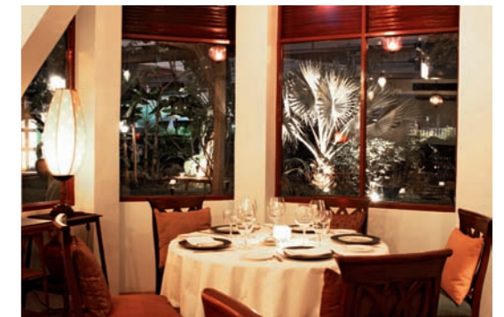
Bounty Hunting Clockwise from top right: A table awaits at Le Café Siam; Again & Again sources its stock from around the globe; a pair of shoes at It's Happened to Be a Closet; the shop's eclectic interior mirrors the goods on sale.

For a retro furniture and household-goods fix, go to Tuba (34 Soi 21, Sukhumvit Soi 63 [Ekamai]; 66-2/622-0708; design-at-home.com ), which sells 70's carpets and 60's sofas by day and turns into a trendy bar come nightfall. Its neighbor, Y50 (24 Soi 21, Sukhumvit Soi 63 [Ekamai]; 66-2/711-5629), also doubles as a bar; test out funky chairs and Art Deco lamps over a few drinks while rubbing elbows with Bangkok's film-industry movers and shakers. Still hungry for more? Head to Le Café Siam (4 Soi Sri Aksorn, Chua Ploeng Rd.; 66-2/671-0030; lecafesiam.com ), a restaurant set in a grand old colonial building, where many of the antiques and artworks are for sale. ✦